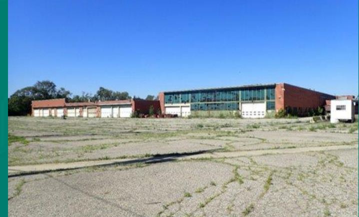
Current Coolidge Site