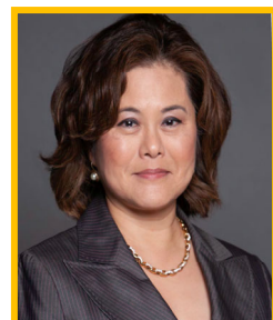
IG Ellen Ha

It is difficult because I am fully aware that every decision I make on behalf of the Office will affect somebody and could potentially cause a cascading effect on how the City governs itself or with whom we conduct business. The role of an IG is not to please or advocate for anyone.